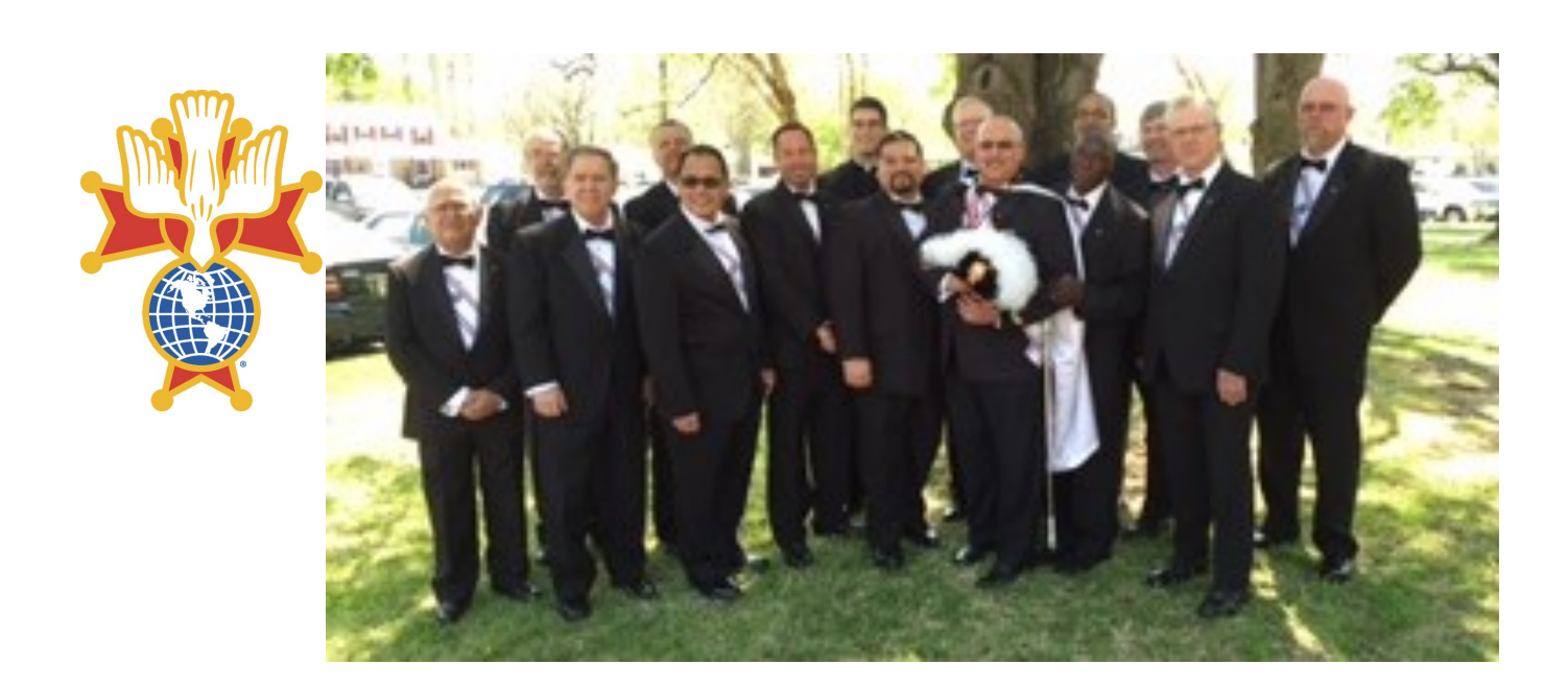
Welcome to our newest Fourth Degree Brothers